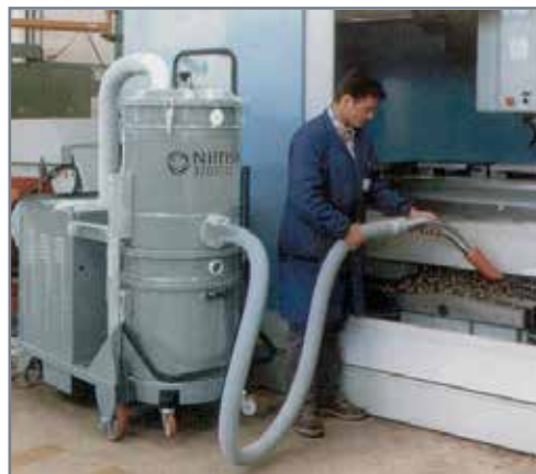
Large capacity collection for longer run times