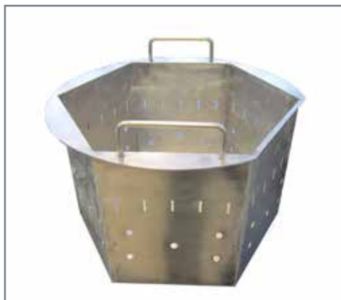
Chip collection basket to effectively separate chips and liquid material