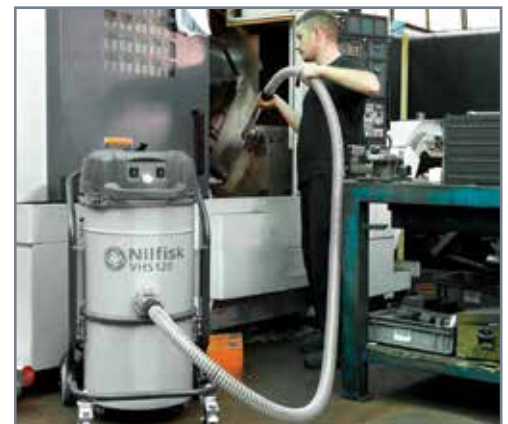
Small footprint for easy access to equipment and machinery