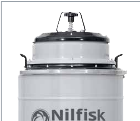
Top-mounted manual filter shaker for ease of use filter cleaning