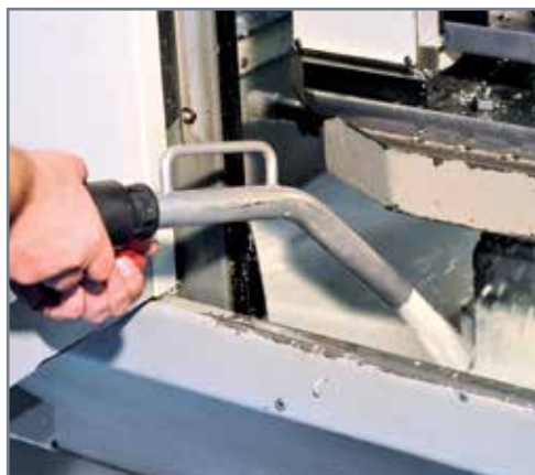
Recycle coolants and lubricants with pump out feature