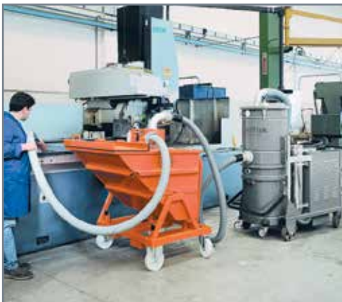
Added filtration and capacity with optional skip hopper

Contact your local Nilfisk sales representative for information on Metalworking specific options.