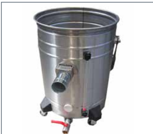
Drain valve located at lowest point for maximum drainage & external min/max level indicator

Contact your local Nilfisk sales representative for information on Metalworking specific options.