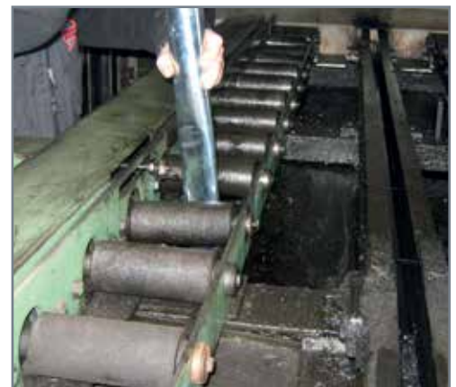
Keep process equipment clean and running at peak performance

Fully designed Metalworking kit comes standard with all necessary connections as well as a dust brush, metal crevice nozzle, wheeled floor nozzle and polyurethane hose. (View page 11 for more details)