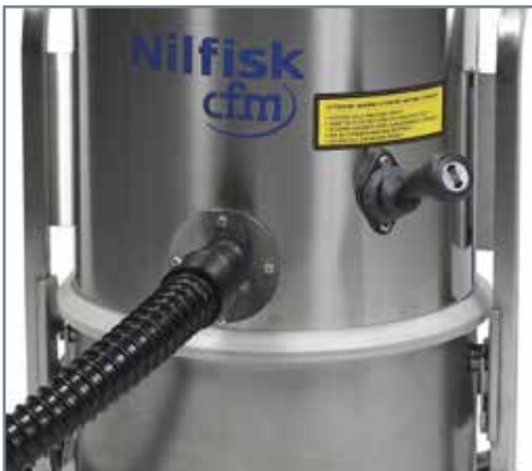
Side-mounted manual filter shaker