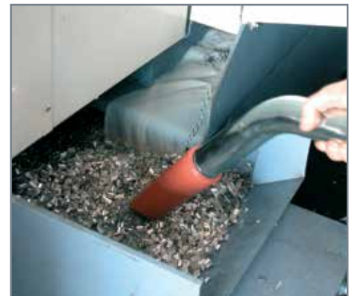
Collect metal chips from fine dust to large debris