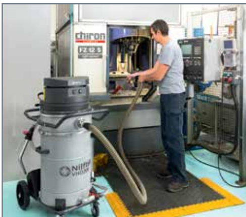
Keep process equipment clean and running at peak performance

Fully designed Metalworking kit comes standard with all necessary connections as well as a dust brush, metal crevice nozzle, wheeled floor nozzle and polyurethane hose. (View page 9 for more details)