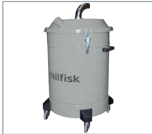
Nilfisk pre-separators provide added filtration and longer working life