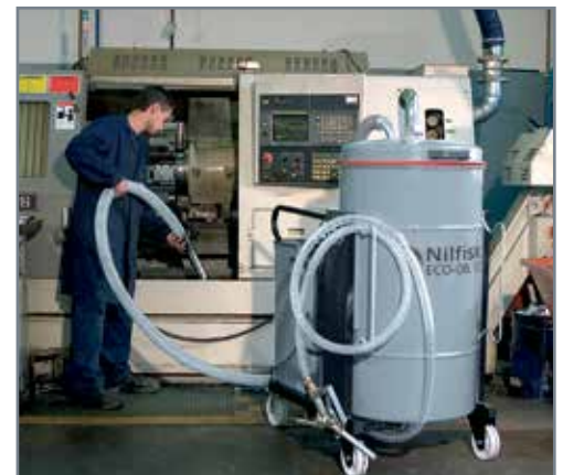
Recover and recycle debris and liquids simultaneously