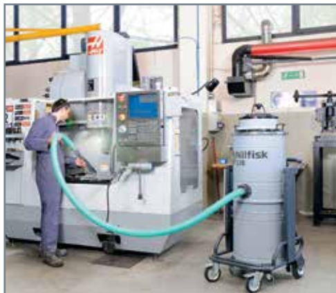
Versatile cleaning, from floor to inside process equipment