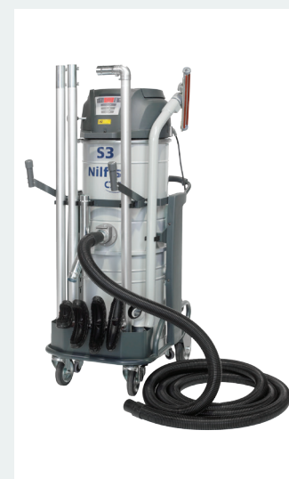
S2 or S3 single-phase vacuums for general housekeeping