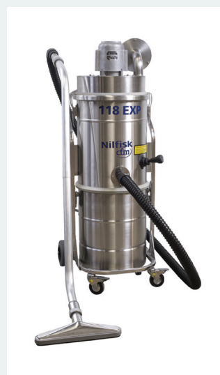
Full line of NRTL-certified, explosion-proof vacuums for combustible dust