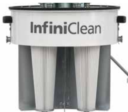
AUTOMATIC FILTER CLEANING