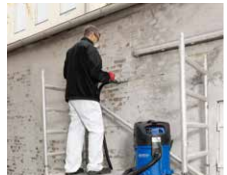
LOCAL EXHAUST VENTILATION SYSTEM FOR GRINDING, TUCKPOINTING AND MORE