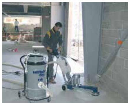
SOURCE CAPTURE FOR FLOOR REFINISHING