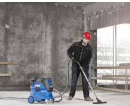
VACUUMING FOR GENERAL HOUSEKEEPING