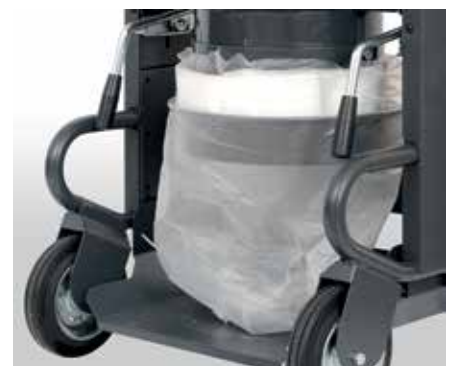
LONGOPAC FOR SAFE SEAL DISPOSAL OF HAZARDOUS MATERIALS