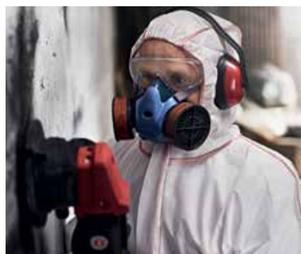
POWERFUL AIRFLOW FOR TOOL AND JOB REQUIREMENTS